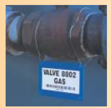
Color-Coded Valve Tags